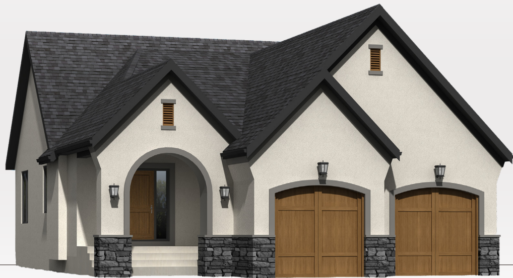
ARTS & CRAFTS ELEVATION